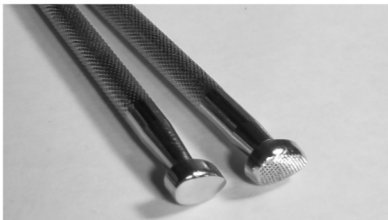
Pear Shader—checked or smooth